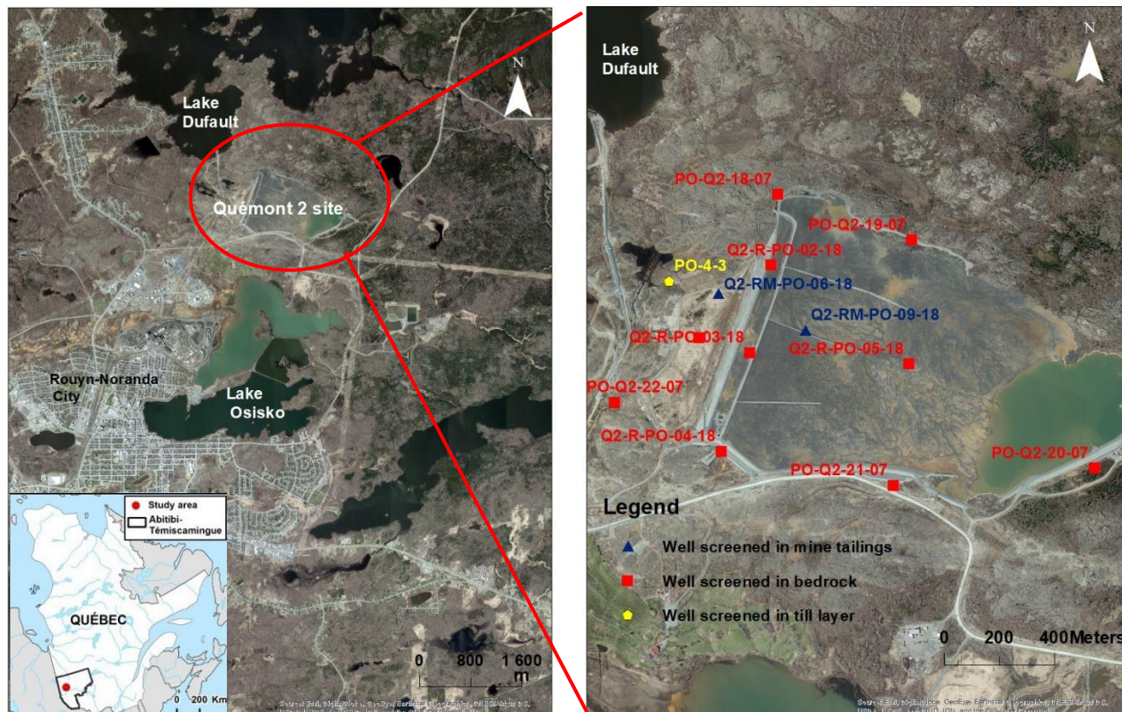
Figure 1 Localisation of the Quémont-2 site and sampled wells